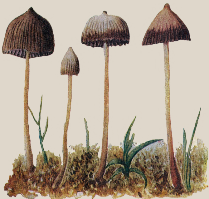
MOST PRIZED by Indians and most widespread of these fungi, Psilocybe mexicana Heim grows in pastures.