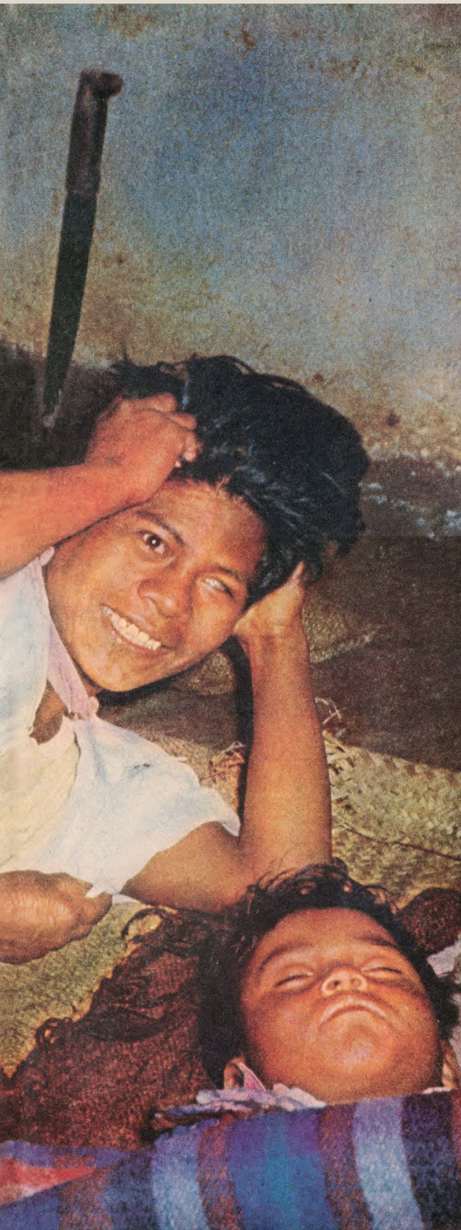
at right, perhaps soothed by the rhythm of the chanting, is sleeping quietly through the ritual. About a dozen Indians remained in the 20 by 20 foot room throughout the night. A few of them sat up but most lay on reed mats.