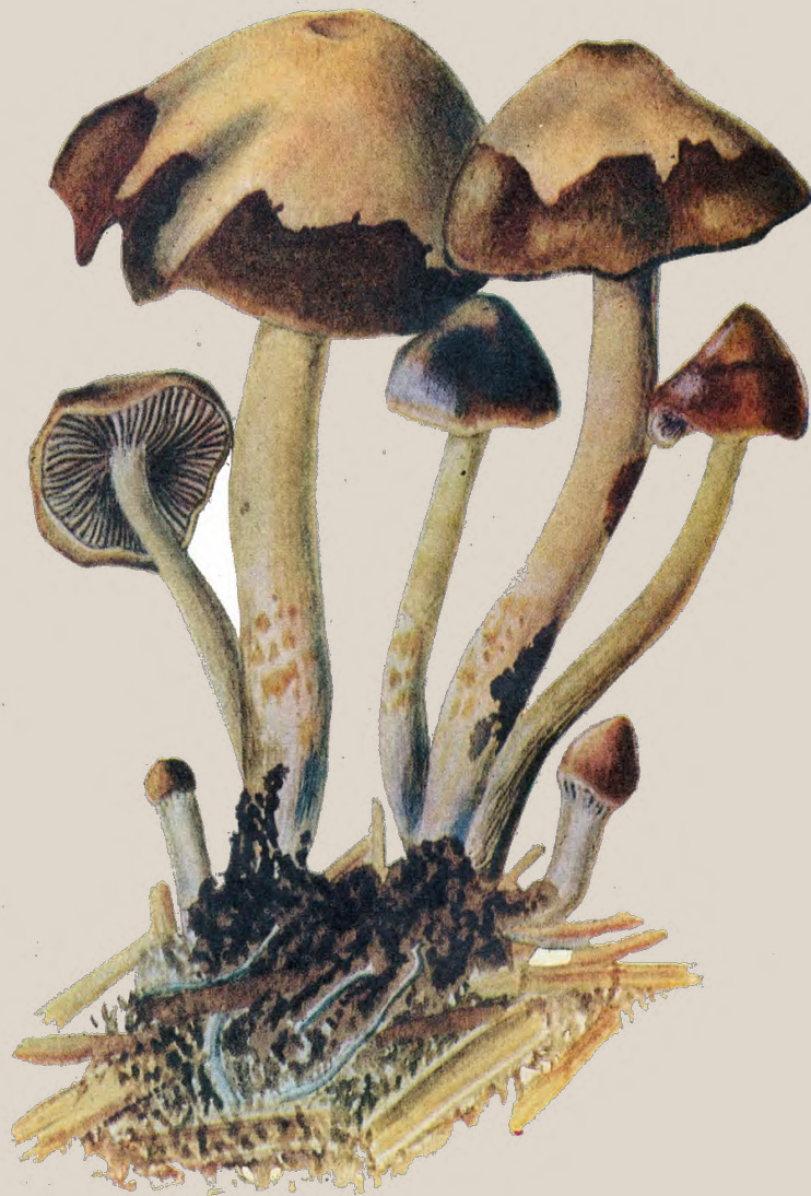
LANDSLIDE" mushroom, Psilocybe caerulescens Murrill, var. Mazotecorum Heim, grows on sugar cane residue.