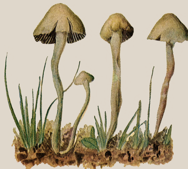
CALLED "Children of the Waters" by Aztecs, Psilocybe Aztecorum Heim grows in grass on volcano Popocatepetl.

At the present time no one knows what drug it is in these mushrooms that causes the eater to see visions, and until its properties are clearly defined the hallucinogenic mushrooms must be treated with extreme caution. Among the Indians, their use is hedged about with restrictions of many kinds. Unlike ordinary edible mushrooms, these are never sold in the market place, and no Indian dares to eat them frivolously, for excitement. The Indians themselves speak of their use as muy delicado , that is, perilous.