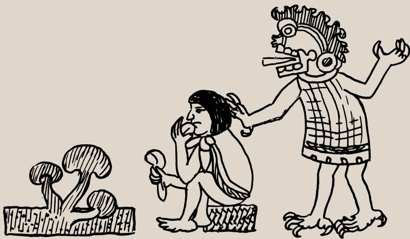
MEXICAN drawing of 16th Century shows three mushrooms, a man eating them and a god behind him, who is speaking through the mushroom.

speaking Indian, when I asked about the effect of the mushrooms, was often this: Le llevem ahi donde Dios está , "They carry you there where God is," an answer that we have received on several occasions, from Indians in different cultural areas, almost as though it were in a sort of catechism. At all times there have been rare souls—the mystics and certain poets—who have had access without the aid of drugs to the visionary world for which the mushrooms hold the key. William Blake possessed the secret: "He who does not imagine in . . . stronger and better light than his perishing mortal eye can see, does not imagine at all." But I can testify that the mushrooms make those visions accessible to a much larger number. The visions that we saw must have come from within us, obviously. But they did not recall anything that we had seen with our own eyes. Somewhere within us there must lie a repository where these visions sleep until they are called forth. Are the visions a subconscious transmutation of things read and seen and imagined, so transmuted that when they are conjured forth from the depths we no longer recognize them? Or do the mushrooms stir greater depths still, depths that are truly the Unknown?