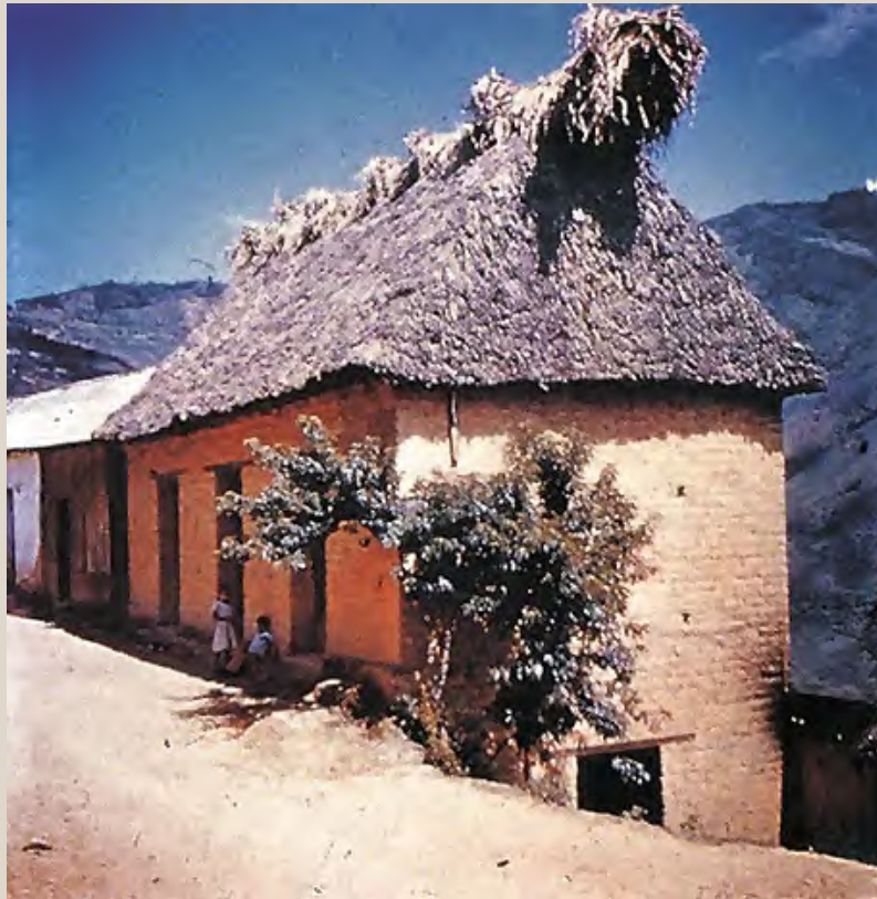
HOUSE where mushroom sessions took place is built of adobe, has thatch "dog-ears" over gable ends. Door, lower right, leads into ceremonial room.

Before midnight the Señora (as Eva Mendez is usually called) broke a flower from the bouquet on the altar and used it to snuff out the flame of the only candle that was still burning. We were left in darkness and in darkness we remained until dawn. For a half hour we waited in silence. Allan fell cold and wrapped himself in a blanket. A few minutes later he leaned over and whispered, "Gordon, I am seeing things!" I told him not to worry, I was too. The visions had started. They reached a plateau of intensity deep in the night, and they continued at that level until about 4 o'clock. We felt slightly unsteady on our feet and in the beginning were nauseated. We lay down on the mat that had been spread for us, but no one had any wish to sleep except the children, to whom mushrooms are not served. We were never more wide awake, and the visions came whether our eyes were opened or closed. They emerged from the center of the field of vision, opening up as they came, now rushing, now slowly, at the pace that our will chose. They were in vivid color, always harmonious. They began with art motifs, angular such as might decorate carpets or textiles or wallpaper or the drawing board of an architect. Then they evolved into palaces with courts, arcades, gardens—resplendent palaces all laid over with semiprecious stones. Then I saw a mythological beast drawing a regal chariot. Later it was as though the walls of our house had dissolved, and my spirit had flown forth, and I was