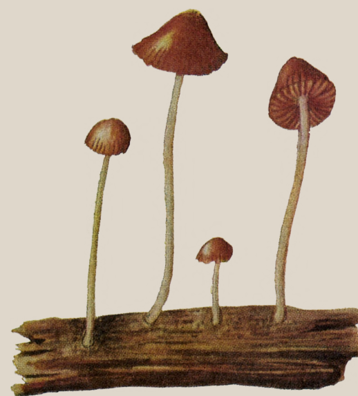
GROWING on certain kinds of dead tree trunks, Conocybe Siligineoides . Heim was collected by Wasson in 1955.