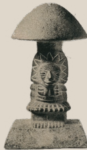
"MUSHROOM stone" from the highlands of Guatemala dates back to 300-600 A.D.

It is no accident, perhaps, that the first answer of the Spanish-