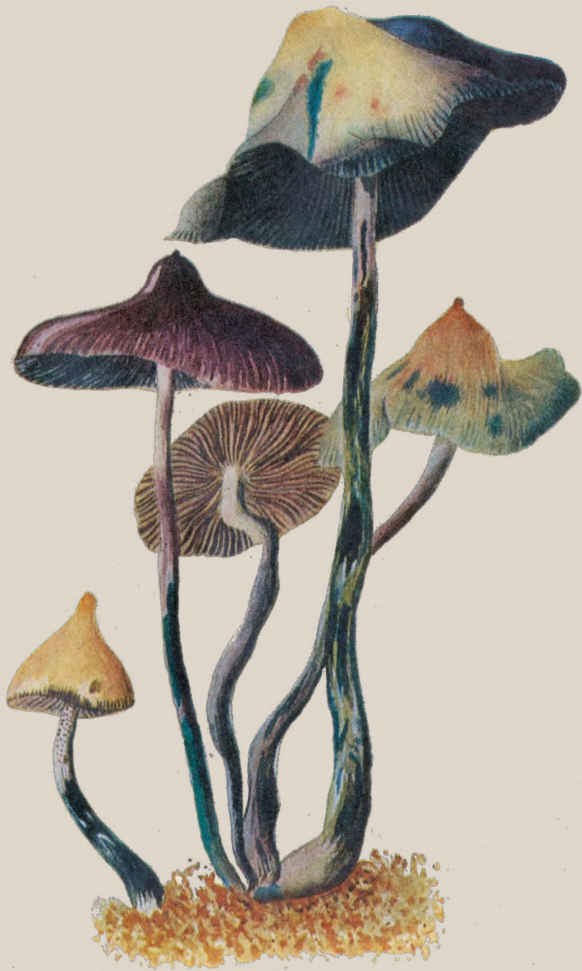
CROWN of Thorns," Psilocybe Zapotecorum Heim (left) grows in marshy ground. It was first found in 1955.