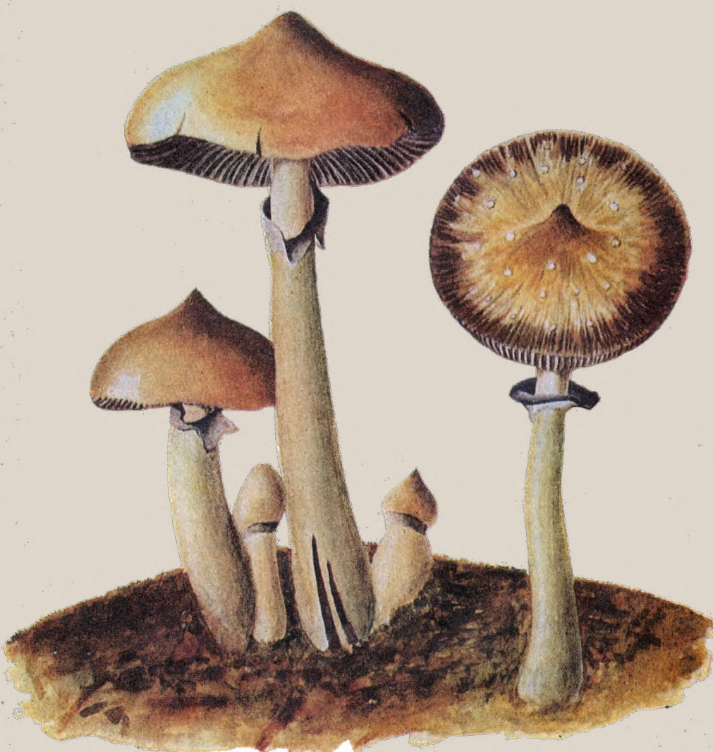
FIRST DISCOVERED in Cuba in June 1904, Stropharia cubensis Earle (right) grows on cow dung in pastures.